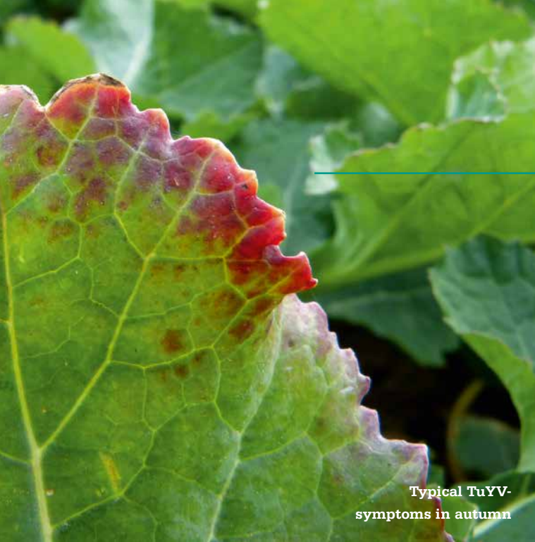
Typical TuYV-symptoms in autumn

Previous studies (Schaardt 2006) suggest that there is nothing new about this viral infection in oilseed rape and that although the incidence appears to have increased in recent years, the impact on yields has not risen.